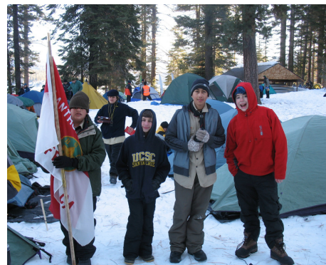
Patrols at Klondike use Scout skills while competing in events

Troops, Teams and Crews from around California are invited to participate in this winter adventure. Camp Chawanakee will be transformed into the Alaskan Yukon where Scouts will be traversing the frontier, going from town to town testing their scout skills, competing for gold, and demonstrating the Patrol Method. Start planning now for a great Scouting adventure!